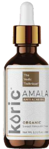
Amala : Resurfacing Anti Acne Oil