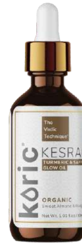
Kesrani: Turmeric & Saffron Glow Oil