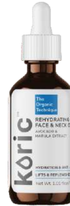
Rehydrating Face & Neck Oil