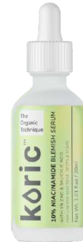
10% Niacinamide Blemish Serum