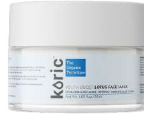
Youth Boost Lotus Face Mask