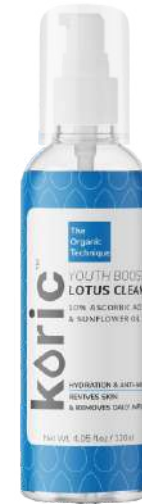
Youth Boost Lotus Cleanser