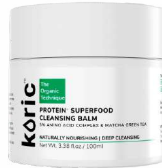
Protein+ Superfood Cleansing Balm