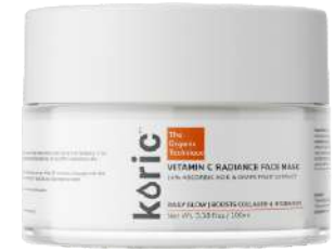
Vitamin C Radiance Face Mask