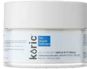
Youth Boost Eye Cream