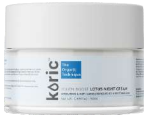
Youth Boost Lotus Night Cream