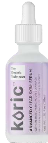
Advanced Clear Skin+ Serum