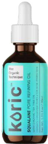
Squalane Pore Refining Oil