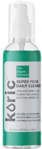
Super Food Daily Cleanser