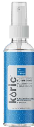
Youth Boost Lotus Tonic