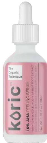
10% AHA Peeling Serum