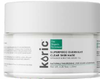
Super Food Overnight Clear Skin Mask