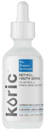
Retinol Youth Serum