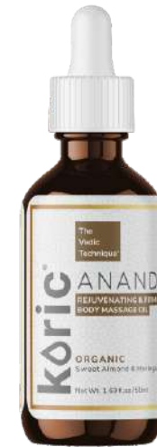
Ananda: Rejuvenating & Firming Body Massage Oil