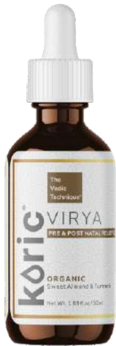
Virya: Pre & Post Natal Relief Oil