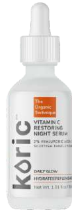
Vitamin C Restoring Night Serum