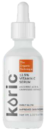
12.5% Vitamin C Serum