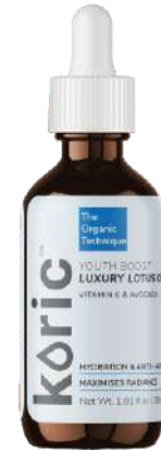
Youth Boost Luxury Lotus Oil