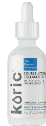
Double Action Collagen Serum