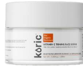
Vitamin C Toning Face Scrub