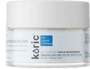
Youth Boost Lotus Moisturiser