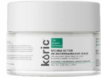
Double Action Microdermabrasion Scrub