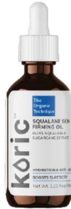
Squalane Skin Firming Oil