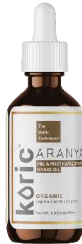
Aranya : Pre & Post Natal Stretch Marks Oil